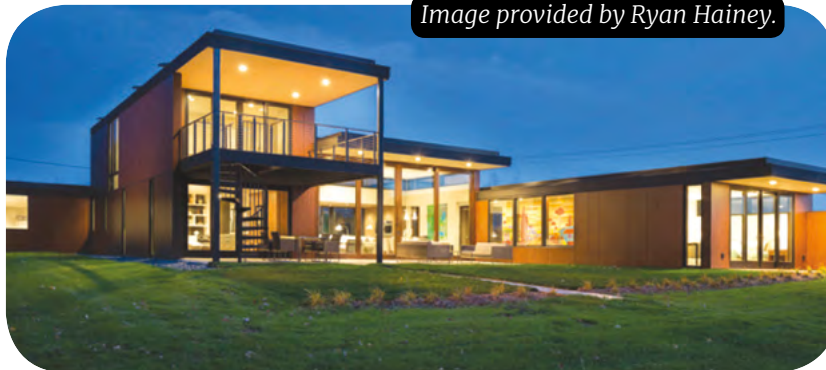
An exterior view of the mHouse featuring PSI’s wall panel system.

For more information on PSI products and services, please visit www.panelspec.com or contact us today!